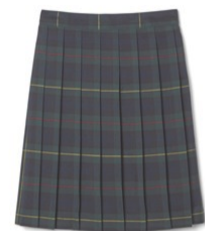
Skirt (6th through 8th)