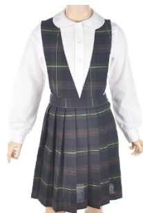
Jumper (K5 to 6th Grade)

You may purchase clothing at any store; however, official school uniforms may be purchased at French Toast: 1-800-373-6248 or go to www.frenchtoast.com and use St. Joseph's Source Code: QS458V9. Using this source code ensures you will be ordering only those uniform items approved by our school. This is the only place that you will be able to order the girls' Green Plaid V-Neck Jumpers and/or Skirts.